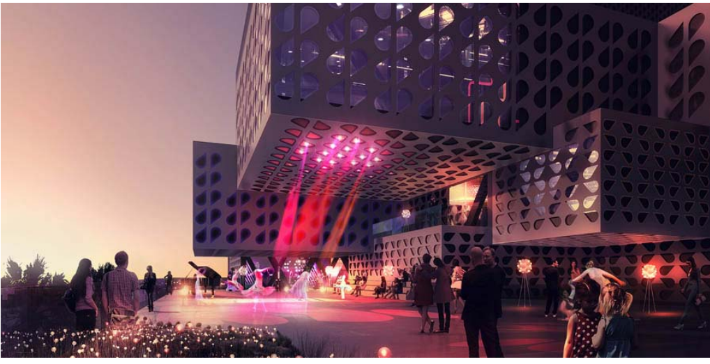
Music and Dance Centre by Manuelle Gautrand Architecture in Ashkelon, Israel.