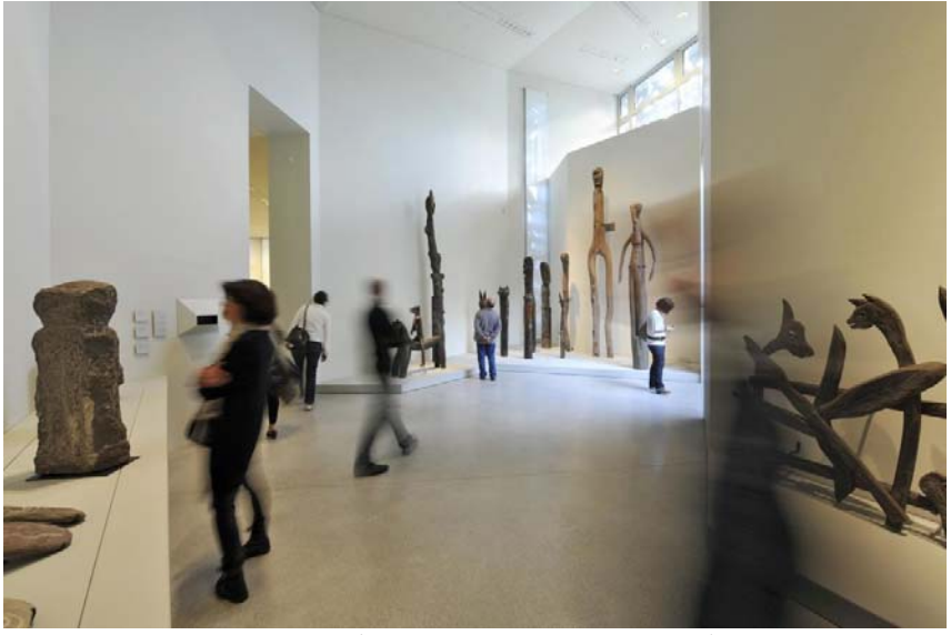
Interior View