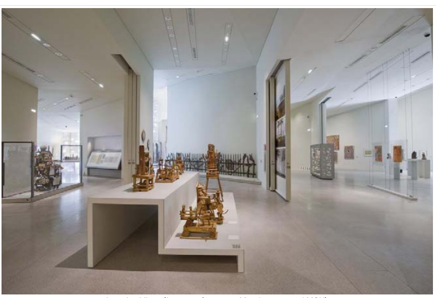
Interior View

Interior View