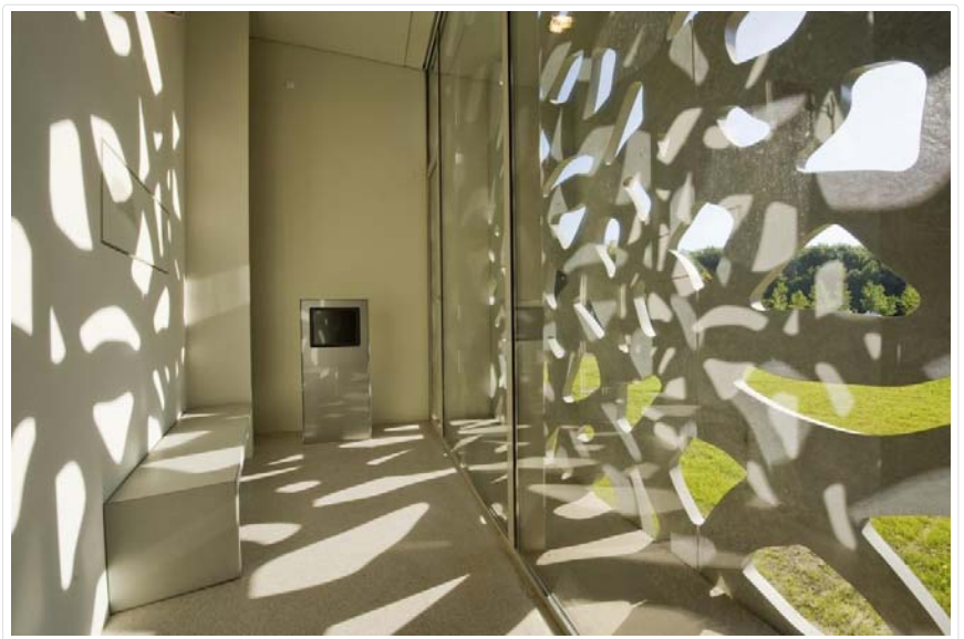
Interior View

At the extremity of the folds – meaning the galleries – a large bay opens magnificent views onto the surrounding parkland, adding breathing space to the visit itinerary. These views make up for the half-light in the galleries: the openwork screens in front of the bays mediate with strong light and parkland scenery, a feature that recalls Simounet's generous arrangements in the galleries that he designed. Envelopes are sober: smooth untreated concrete, with mouldings and openwork screens to protect the bays from too much daylight. The surface concrete has a slight colour tint that varies according to intensity of light.