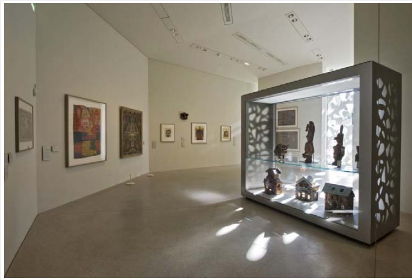
Interior View