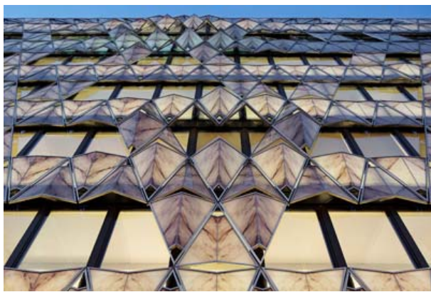
Origami, marble-printed street elevation (ph: Manuelle Gautrand)

Manuelle Gautrand Architecture have completed a 6,000 square metre office building within 200 metres of the Arc de Triomphe in Paris. Developed for Grecina, the building now houses the French headquarters of Barclays Capital Bank.