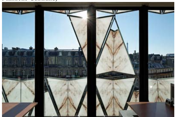
Internal view of the second skin on the front elevation