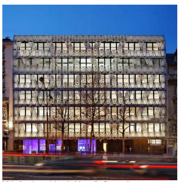
Main facade at night