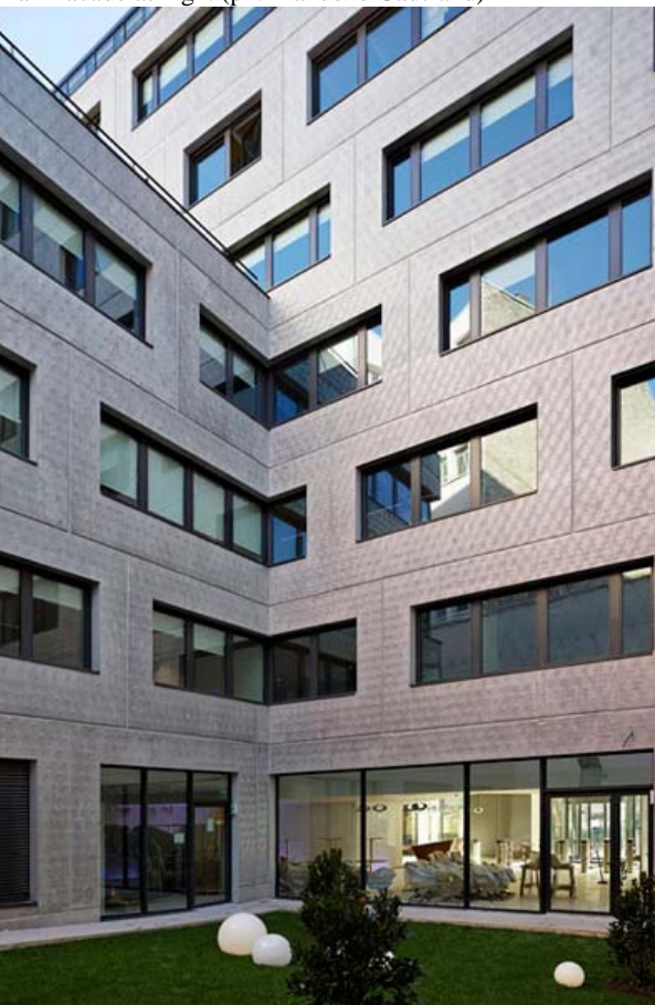
View of the rear elevation from one of the courtyards