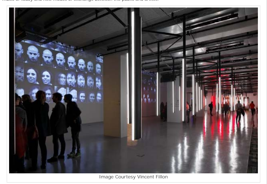
To animate these fluctuations of programme and accompany the many changes in spatial layout, mobile guide modules, called "Eclaireuses" are provided. Mounted on rollers, these container-size units move from place to place, creating a changing scenography. There are today 70 Eclaireuses in the building Also assisting he public in its movements is a long dodecaedric furniture ribbon that threads the entire layout: welcoming, accompanying, and providing rest.

Our objective was to create a permissive place that includes whatever is random and unexpected, a place that defines itself without predefining everything, that enables encounters in fusion and breaks down barriers between the digital arts, the music of today and new modes of exchange between the public and artists.