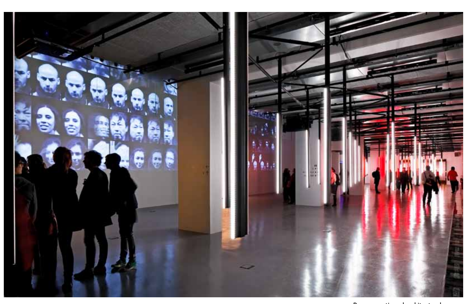
Programmatic and architectural challenges faced the design team while ensuring the best possible use