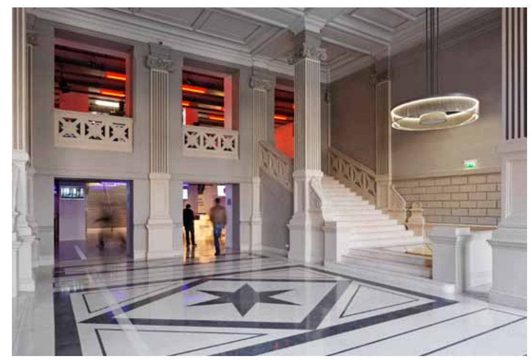
From the grand, marble-clad entrance, visitors immediately see the mix of modern and historic aspects.