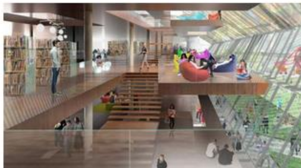
Image © Manuelle Gautrand Architecture, Lacoste+Stevenson & Designinc

Core to the building design is a stack of transparent glass that gradually rises to the north-east with a large LED screen for the public art projections. Built into the entire lower levels of the southern façade will be a LED screen for multimedia projections, which will be able to display images such as public art and event programs. The upper levels of the southern façade will also be able to be used for projections of public art.