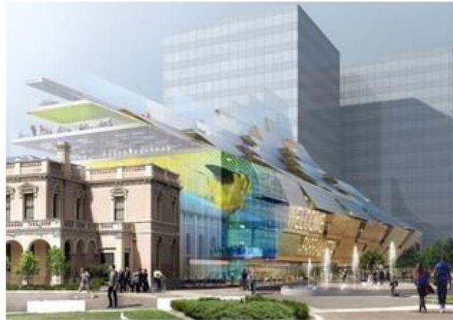
Image © Manuelle Gautrand Architecture, Lacoste+Stevenson & DesignInc

A cutting-edge glass construction featuring a wave-shaped façade of crystalline blocks has been selected as the winning design for Parramatta Square's landmark civic and community building. The design has been endorsed by Parramatta City Council after a jury voted unanimously to award the international design competition to a consortium of French firm Manuelle Gautrand Architecture and Australian firms DesignInc and Lacoste + Stevenson.