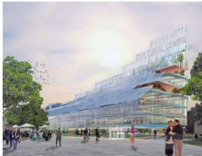
Image © Manuelle Gautrand Architecture, Lacoste+Stevenson & DesignInc

"The jury was tasked with selecting an iconic design and they have certainly fulfilled that brief. The architects have produced a contemporary and thought-provoking design that is sure to become a must-see destination for visitors to Parramatta, and we congratulate the team on producing a spectacular winning design" Lord Mayor of Parramatta Cr Paul Garrard Cr Garrard said. The eye-catching design encapsulates and extends above the historic Town Hall with a cantilevered structure providing a platform for the Council Chambers.