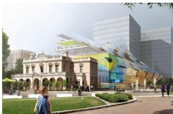
Image © Manuelle Gautrand Architecture, Lacoste+Stevenson & Designinc