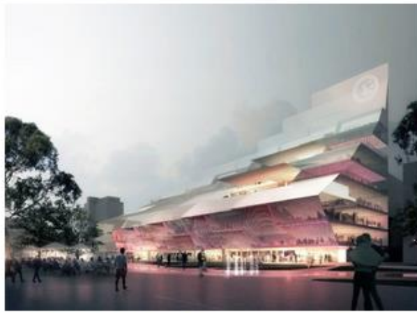
Image © Manuelle Gautrand Architecture, Lacoste+Stevenson & Designinc

Core to the building design is a stack of transparent glass that gradually rises to the north-east with a large LED screen for the public art projections. Built into the entire lower levels of the southern façade will be a LED screen for multimedia projections, which will be able to display images such as public art and event programs. The upper levels of the southern façade will also be able to be used for projections of public art.