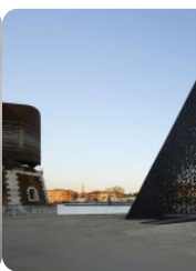
5 David Adjaye's temporal device Architectural B