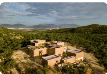
1 Detail: Rammed Earth Walls of Casa Ballena, Los Cabos