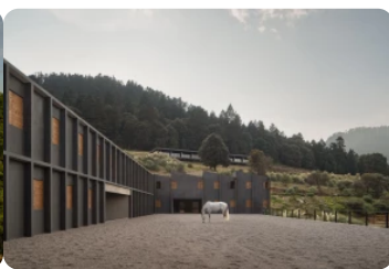
2 Mexican equestrian clubhouse provides haven for horses and horse lovers alike