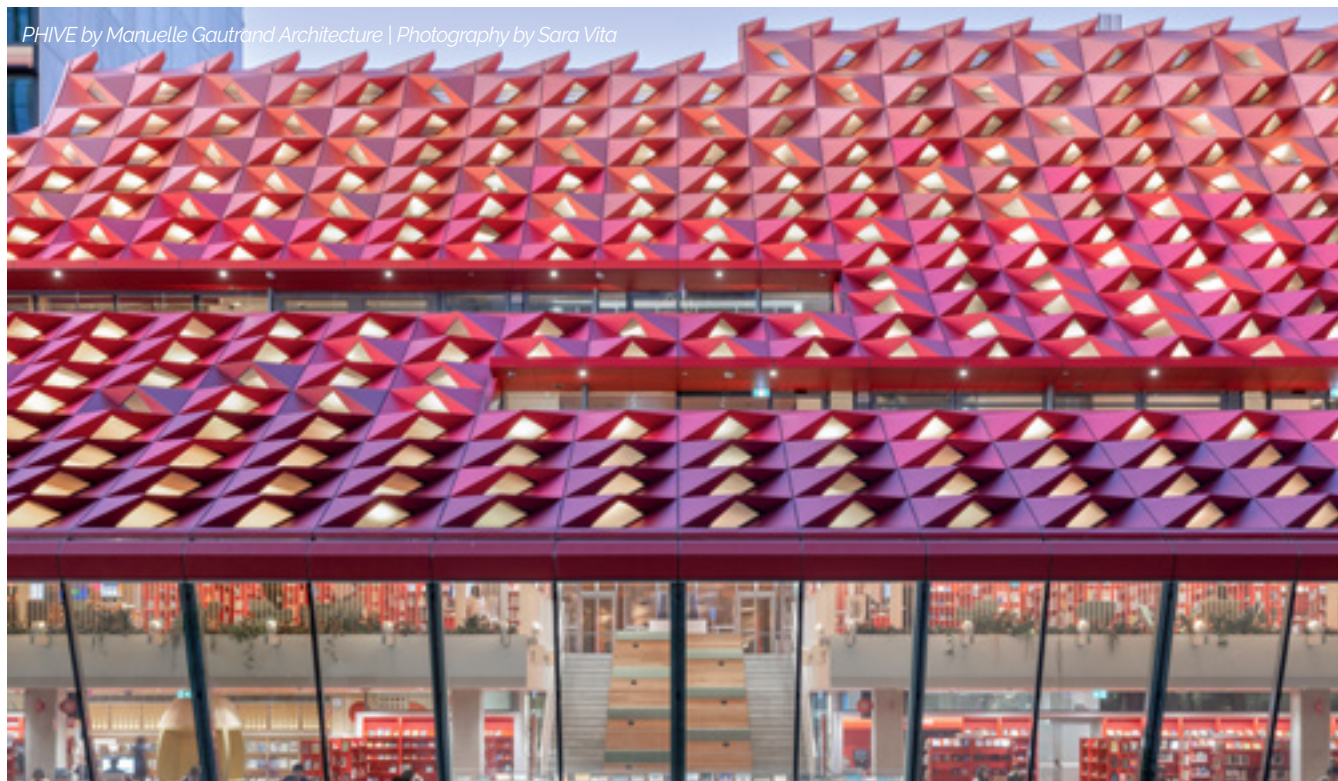
PHIVE by Manuelle Gautrand Architecture