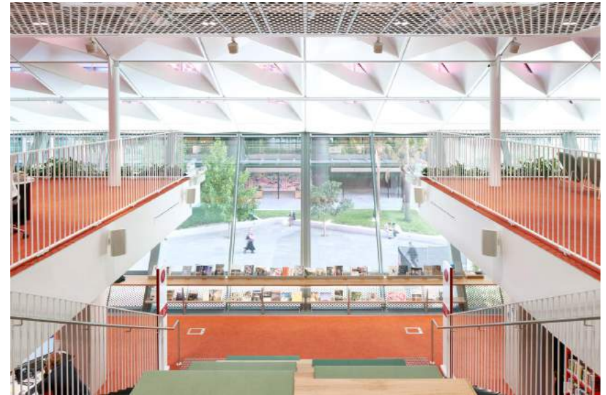
The levels are recessed like terraces, offering diverse views over Parramatta Square.

The characteristic building shell consists of many folded panels equipped with windows that cast both light and shade on the interior. As these elements ascend, their colours graduate from dark to light shades of red, creating a fluid transition to the sky.