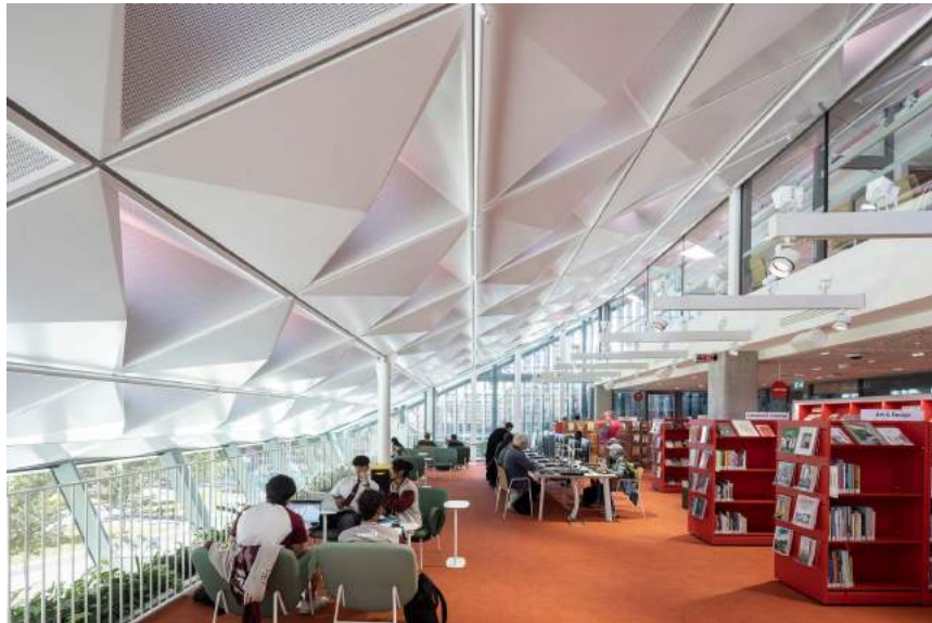
Along with exhibition spaces and rooms for the local city council, the public library is the heart of the complexes, offering diverse views over Parramatta Square.

The design gives consideration to the local architectural heritage. Manuelle Gautrand Architecture intend to use the open ground-floor layout to functionally connect the neighbouring city hall with the civic centre.