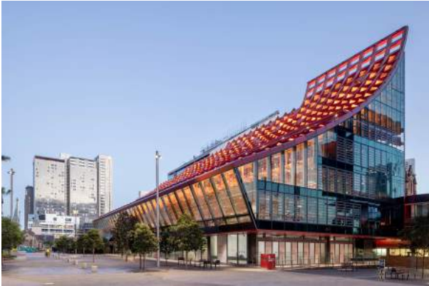
The open ground floor invites visitors to explore the building. © Sara Vita

The building shell rises skywards in a wave of reds as this new, multifunctional community centre in Parramatta assertively defines the centre of the city.