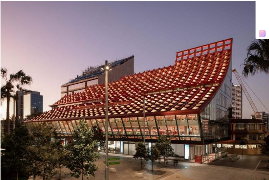
The new civic centre occupies a prominent place on Parramatta Square, the main plaza of the eponymous city.

culturelibrarybuilding envelopeexhibition buildingcity hall