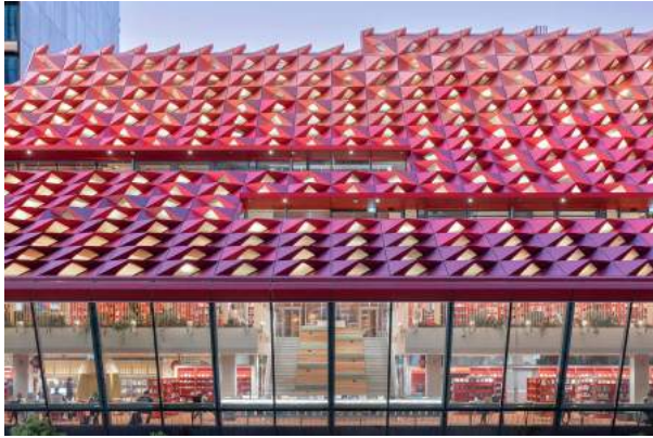
The building shell consists of many elements in various shades of red: these serve as both roof and facade.